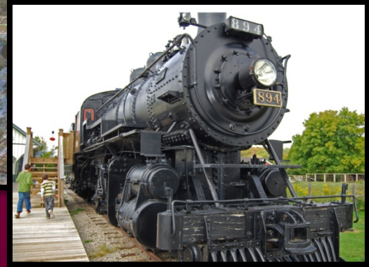
Doon Heritage Village