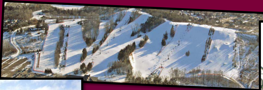
Chicopee Ski Park