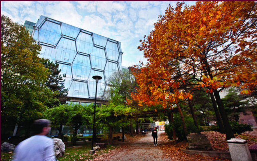
University of Waterloo

The city of Waterloo is world renown and home to the University of Waterloo, Wilfred Laurier University, RIM and the Perimeter Institute. It is a strong technology centre and has a population over 100,000.