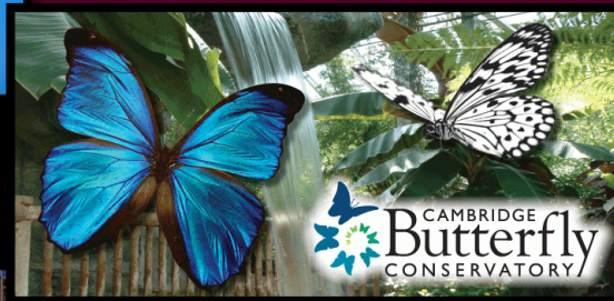
Museums & Conservatories