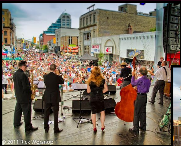
Kitchener Blues Festival