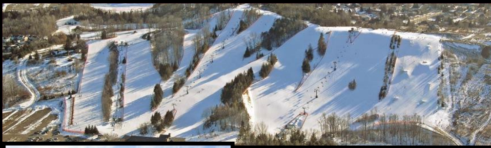
Chicopee Ski Park