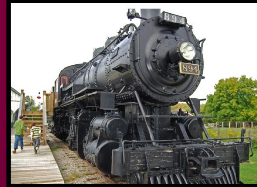
Doon Heritage Village