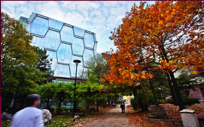
University of Waterloo

The city of Waterloo is world renowned and home to the University of Waterloo, Wilfrid Laurier University, RIM and the Perimeter Institute. It is a strong technology centre and has a population over 100,000.